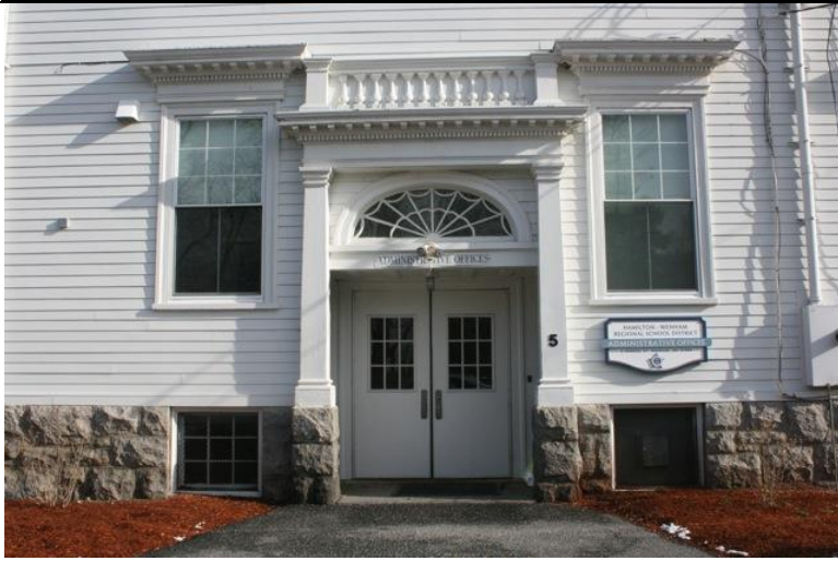
Photo 4. Detail of west entrance bay.