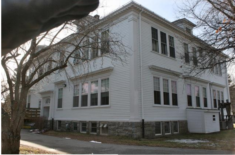
Photo 2. East and north elevations.