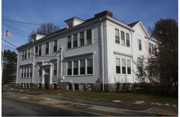
Photo 1. West and south elevations.