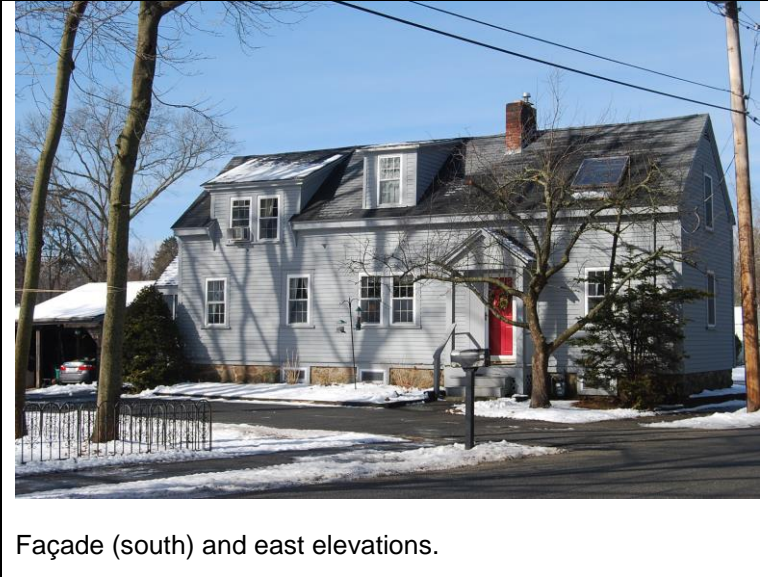
Façade (south) and east elevations.