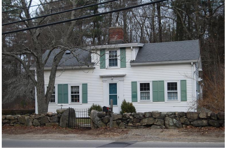
Façade (west) elevation.