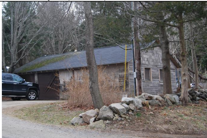
Photo 4. Garage.