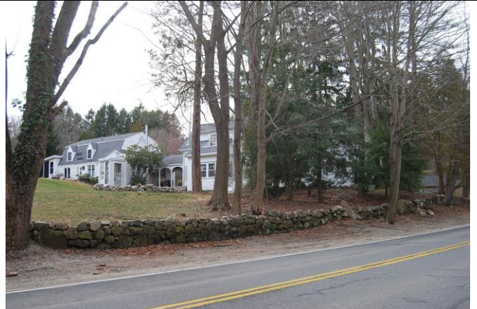
Photo 3. Outbuilding at left. House behind trees at right.