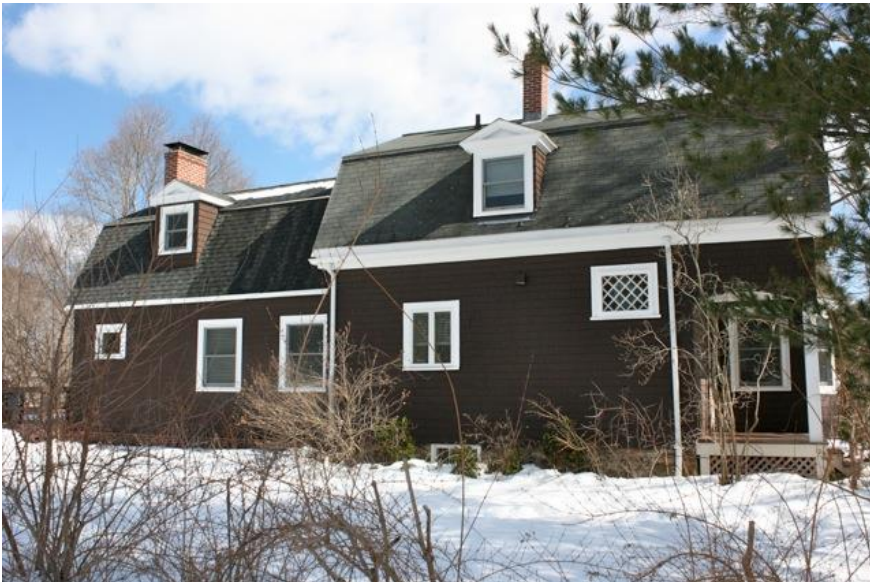
Side (west) elevation.