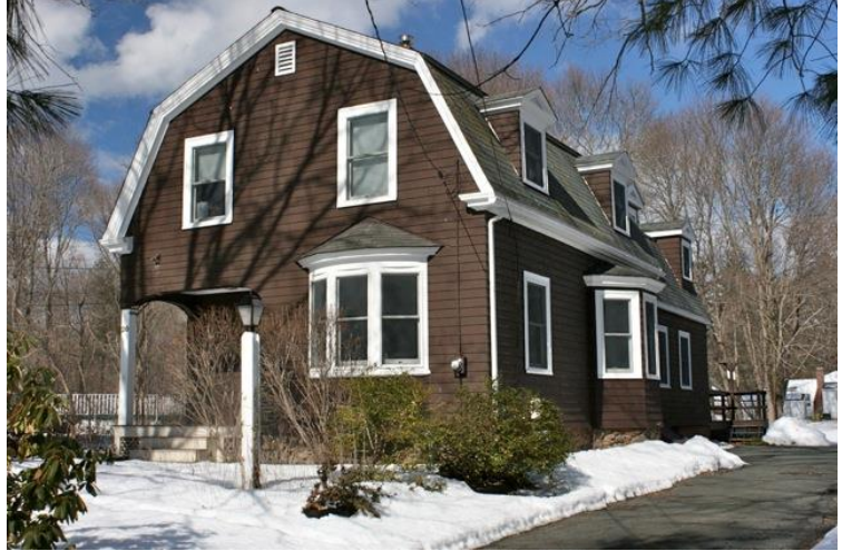
Façade (south) and east elevations.